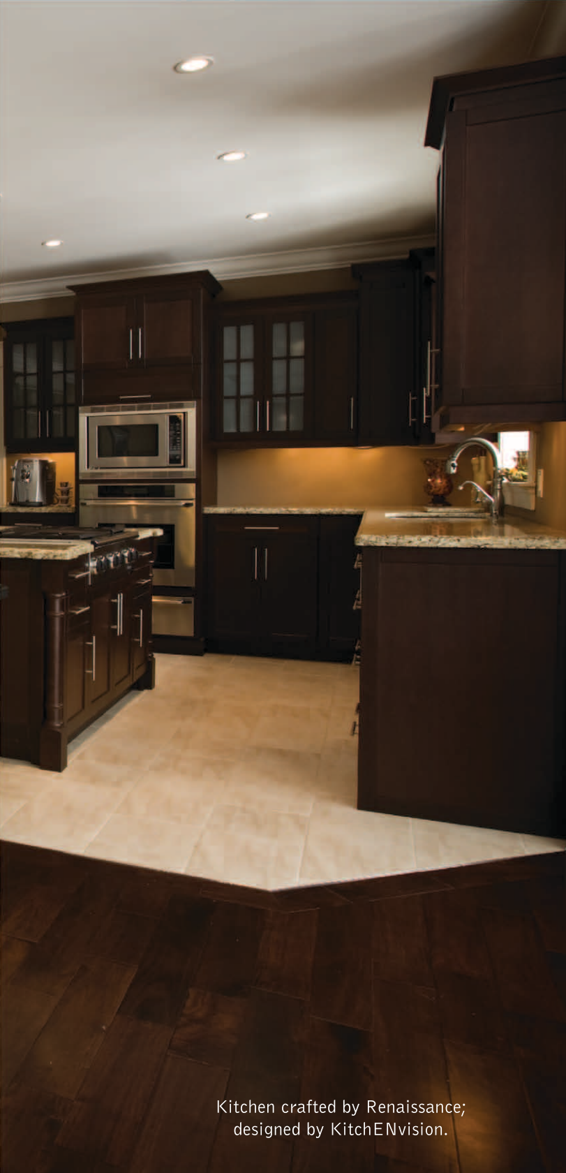
Kitchen crafted by Renaissance; designed by KitchENvision.

THIS RECENTLY REMODELED kitchen is the product of creativity and craft. The design tackles the space ambitiously and with great success, and no detail was spared in its execution. Several specially tailored elements have come together to meld the kitchen seamlessly with the space, and to make it a constant source of interest for admirers, of which it is sure to have plenty. Hidden behind the décor are all the amenities of a kitchen that is easy to organize and work in – not to mention host any type of gathering.